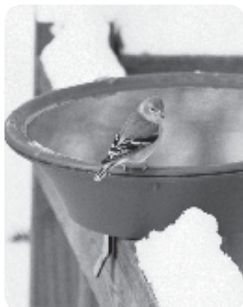
WBU Heated Bird Bath

Some concrete baths with an added heater may not be able to handle freezing weather. To be safe, place a plastic bird bath dish with a heater on the existing pedestal.